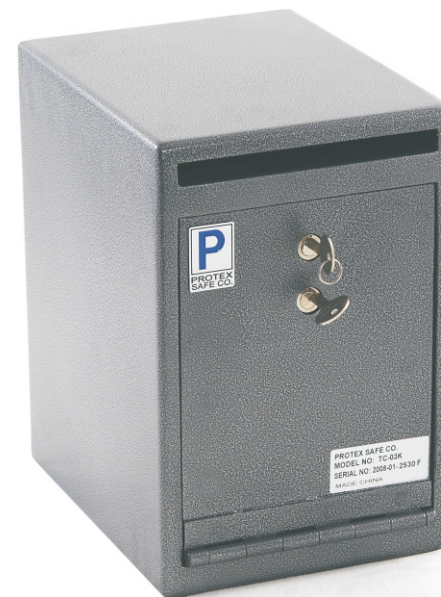
← TC-03K Exterior Dimensions: 8" (W) x 12" (H) x 10" (D) Weight: 31 Lbs. Combination Lock